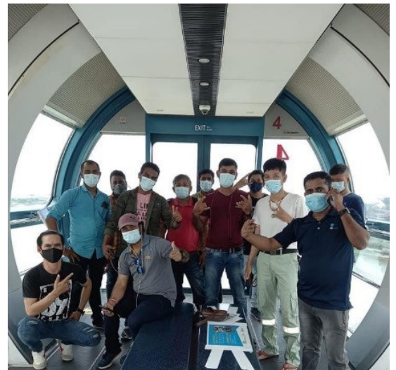
itsRainingRaincoats brings FW to Singapore Flyer

NGO itsRaining Raincoats has been organizing free trips for STL residents to Singapore Flyer. This started in May 2022 and it was also a response to the restriction imposed on migrant workers exiting the dormitory and traveling out to community places. With the lifting of the travel restriction, these Singapore Flyer free trip is no longer a scheduled event. However, the NGO would arrange such trip on case-by-case basis when employer approach them directly and request for it. Many of our residents have participated and enjoyed these outings and STL would like to put on record our appreciation of the NGO effort.