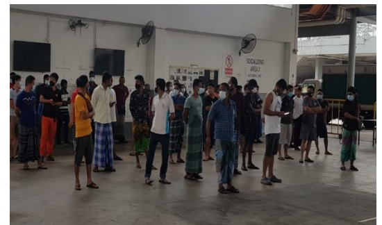
Debriefing residents at the assembly area