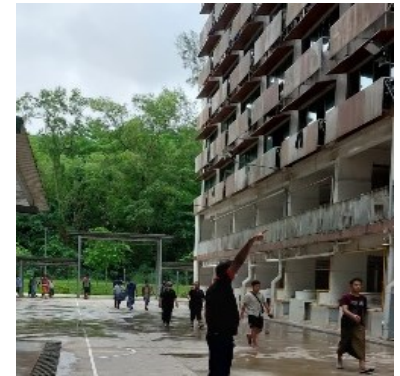
Evacuation of residents

The Car Park & Security Dept (CPSD) conducted fire drill at Cluster 5 on 25 June 2022, 9am to 10am. A near-realistic situation was given for staff to think and react in an emergency. Action of the CERT, Cluster 5 staff and Fire Wardens. "Fire" was extinguished, evacuation and injured assisted to holding and first-aid area. Residents were thanked for their cooperation and debriefing done. Complete exercise 20 minutes.