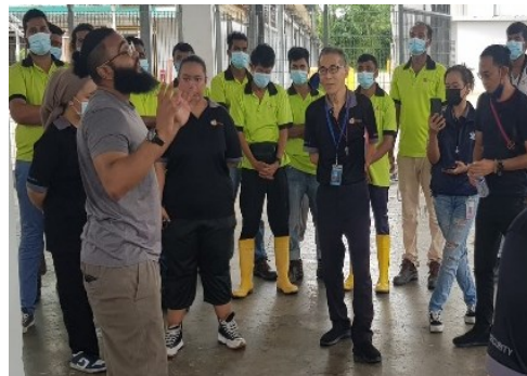
STL Security manager debriefing staffs & fire wardens