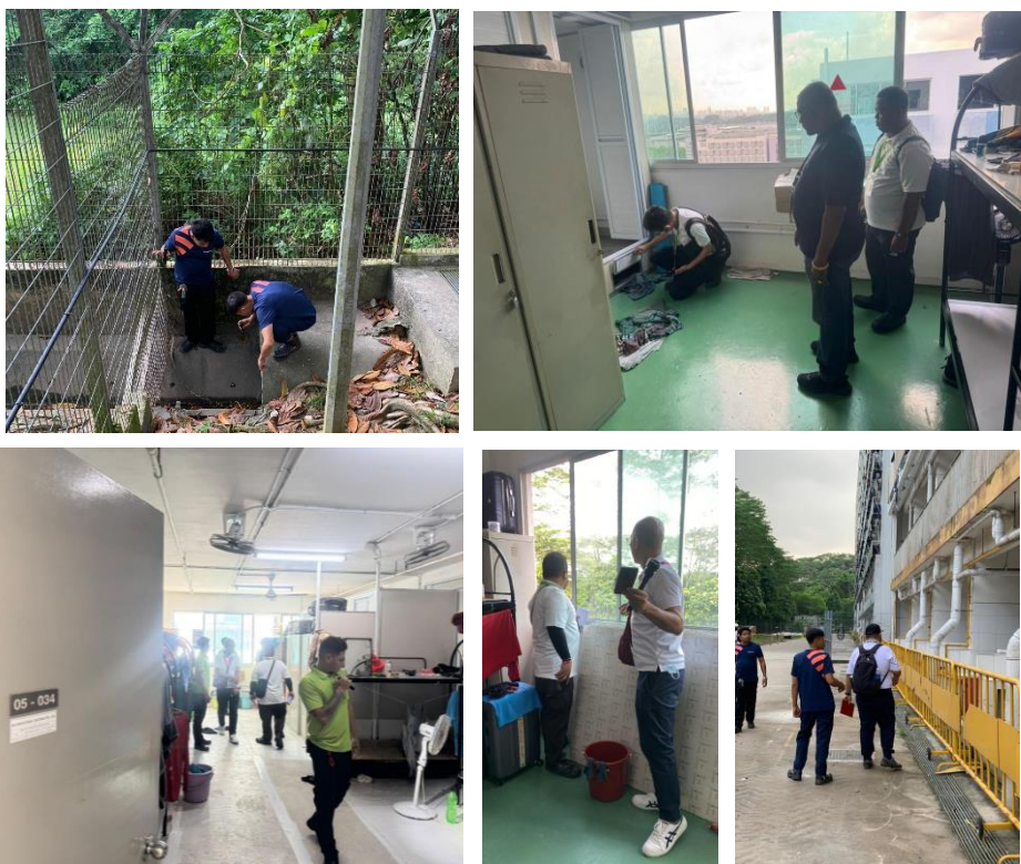
NEA Officer visited STLodge to conduct an inspection and assist in dengue prevention.

To this end, we welcome unannounced visits from NEA to ensure our compliance with health and safety regulations. In October 2024 alone, we received four such visits. These inspections reassure us that our proactive measures are effective in preventing the spread of dengue fever and other transmissible diseases.