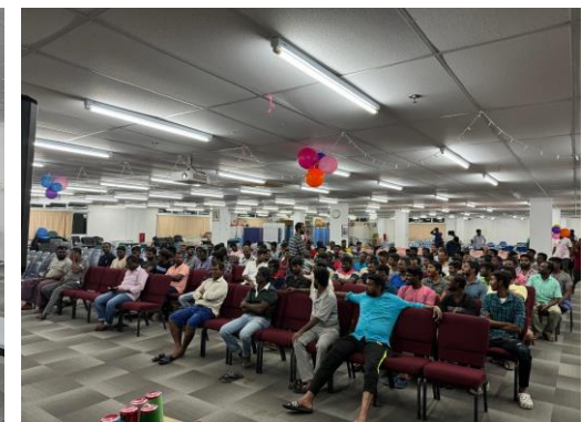
STL residents celebrated Deepavali with good food, prizes and fun games.