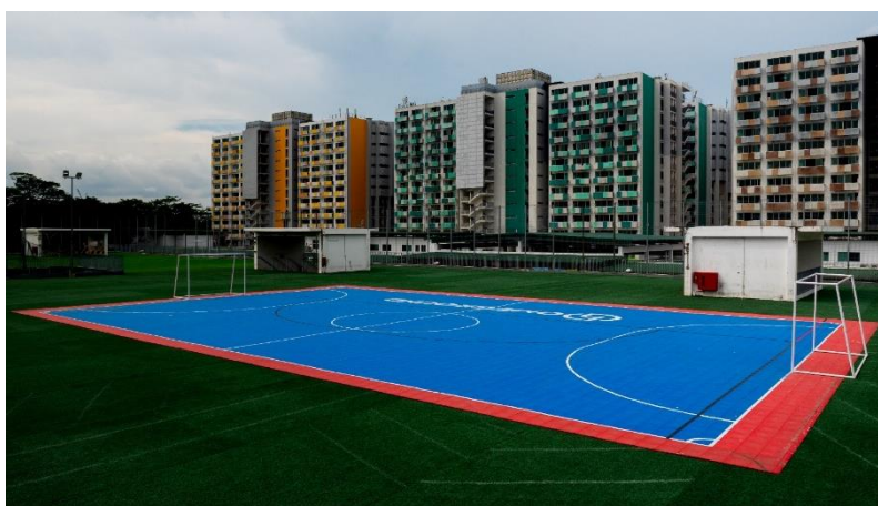
Newly installed Futsal field at the STLodge car park roof