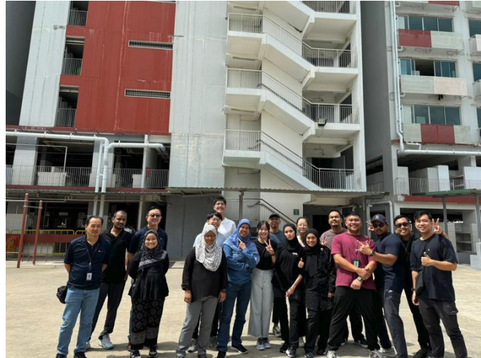
STLodge staff assisted the Custom Department

On 19 September 2024, we hosted staff from the Customs Department. This visit provided an opportunity to exchange knowledge on dormitory management and learn how they address issues related to duty-unpaid cigarettes, alcohol, and drugs. The insights shared were invaluable and will help us enhance our management practices to ensure a safe and compliant living environment for all residents