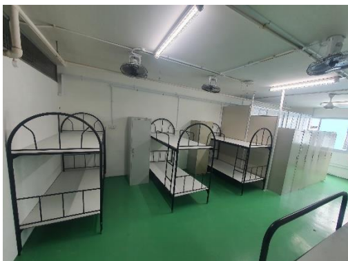
Completed room with Ensuite Toilet