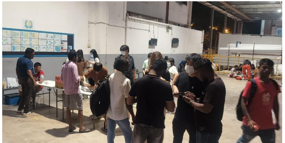
SATA staff provide medical assistance to residents.

STL collaborated with SATA to set up a booth promoting a healthy lifestyle. Medical professionals from SATA were available to answer questions and provide personalized advice to our migrant