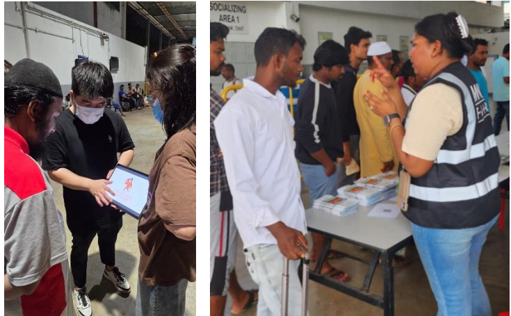
MOM officer's interview with the residents

STL hosted the Ministry of Manpower (MOM) as part of our common goals in engaging workers through interview sessions over 2 Sundays. Feedback from workers allows MOM to formulate better policies to improve living and working condition for all Migrant Workers.